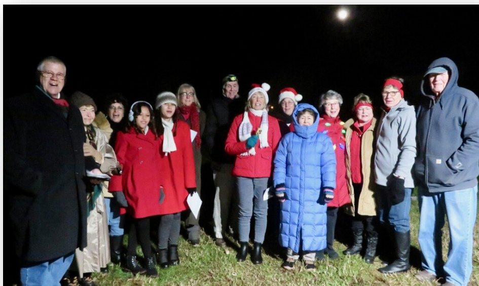
Clarksbury Christmas Caroling