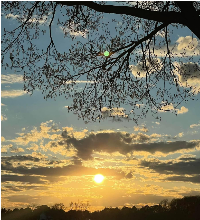
Sunset at the parsonage